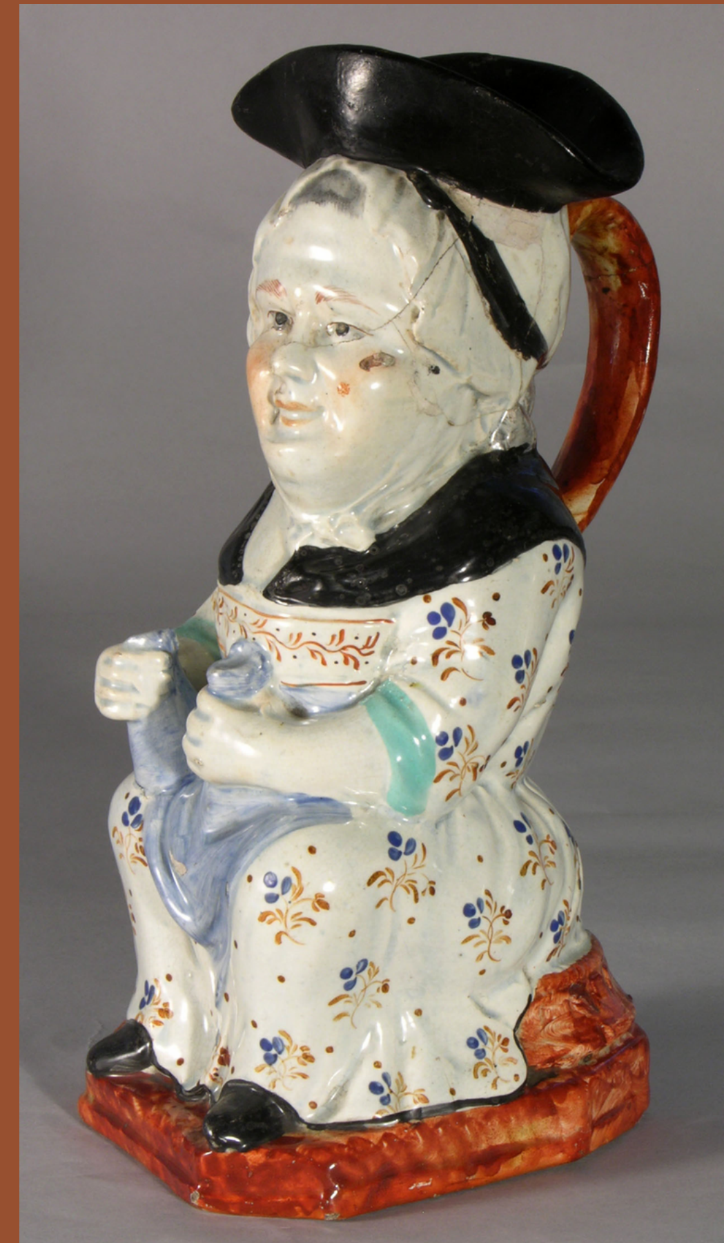
Martha Gunn Jug, Brighton Museums