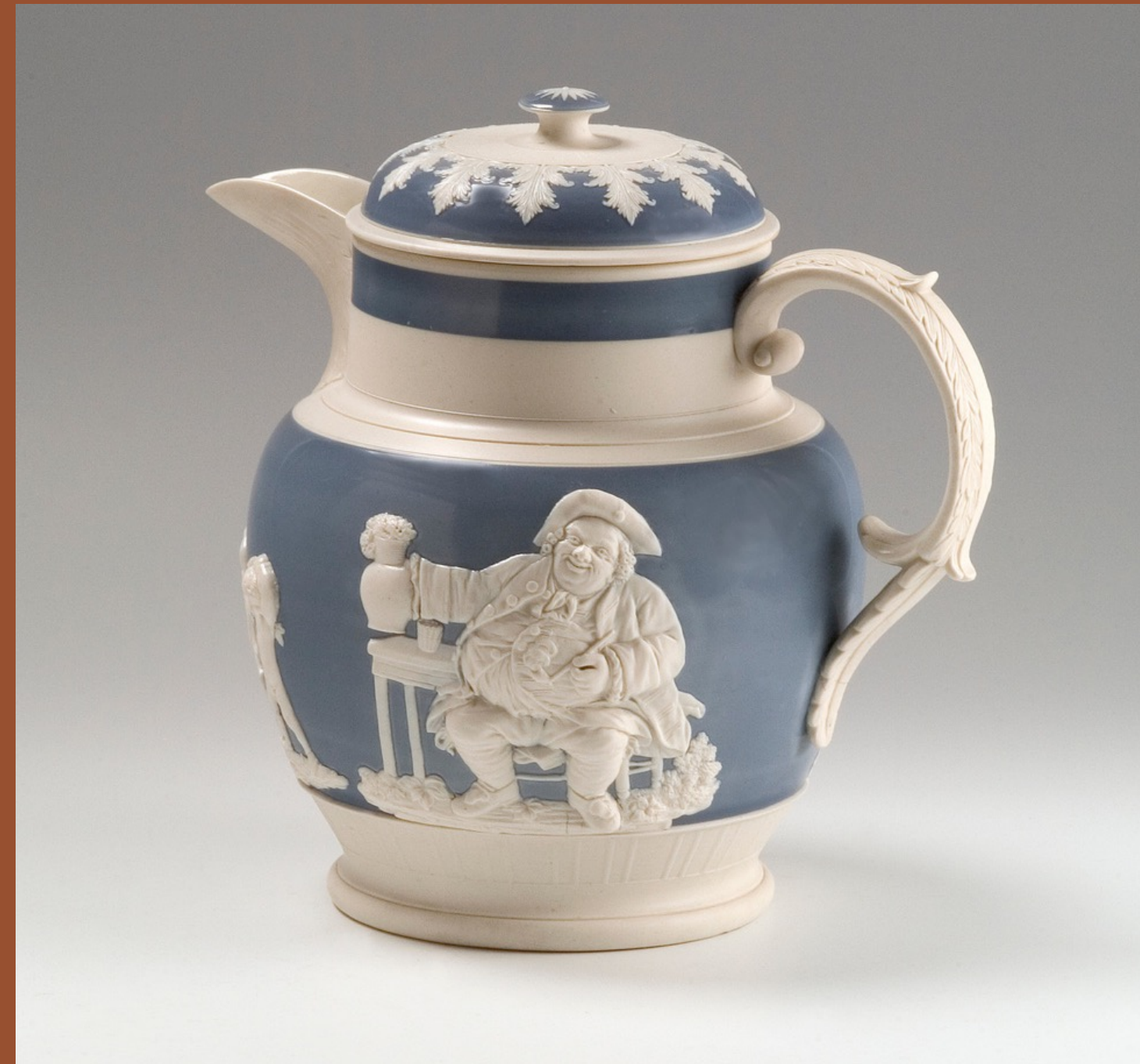
Brighton Museums and Art Gallery