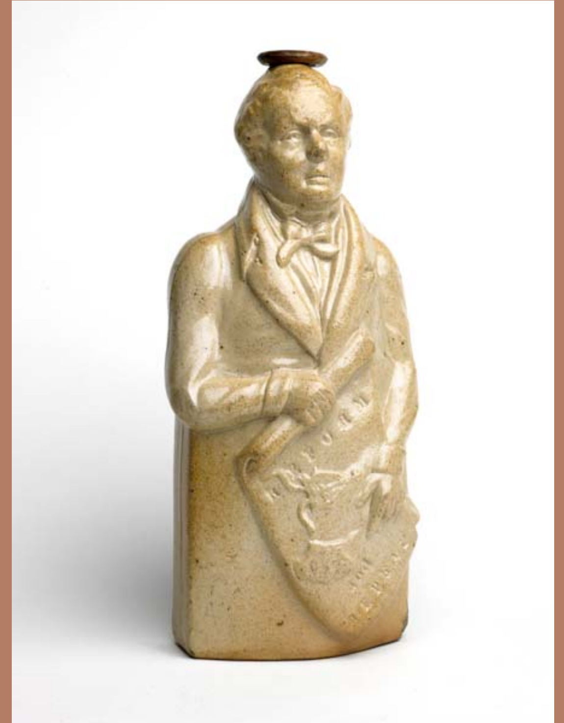
Lord Grey Flask, Museum of London, 1832