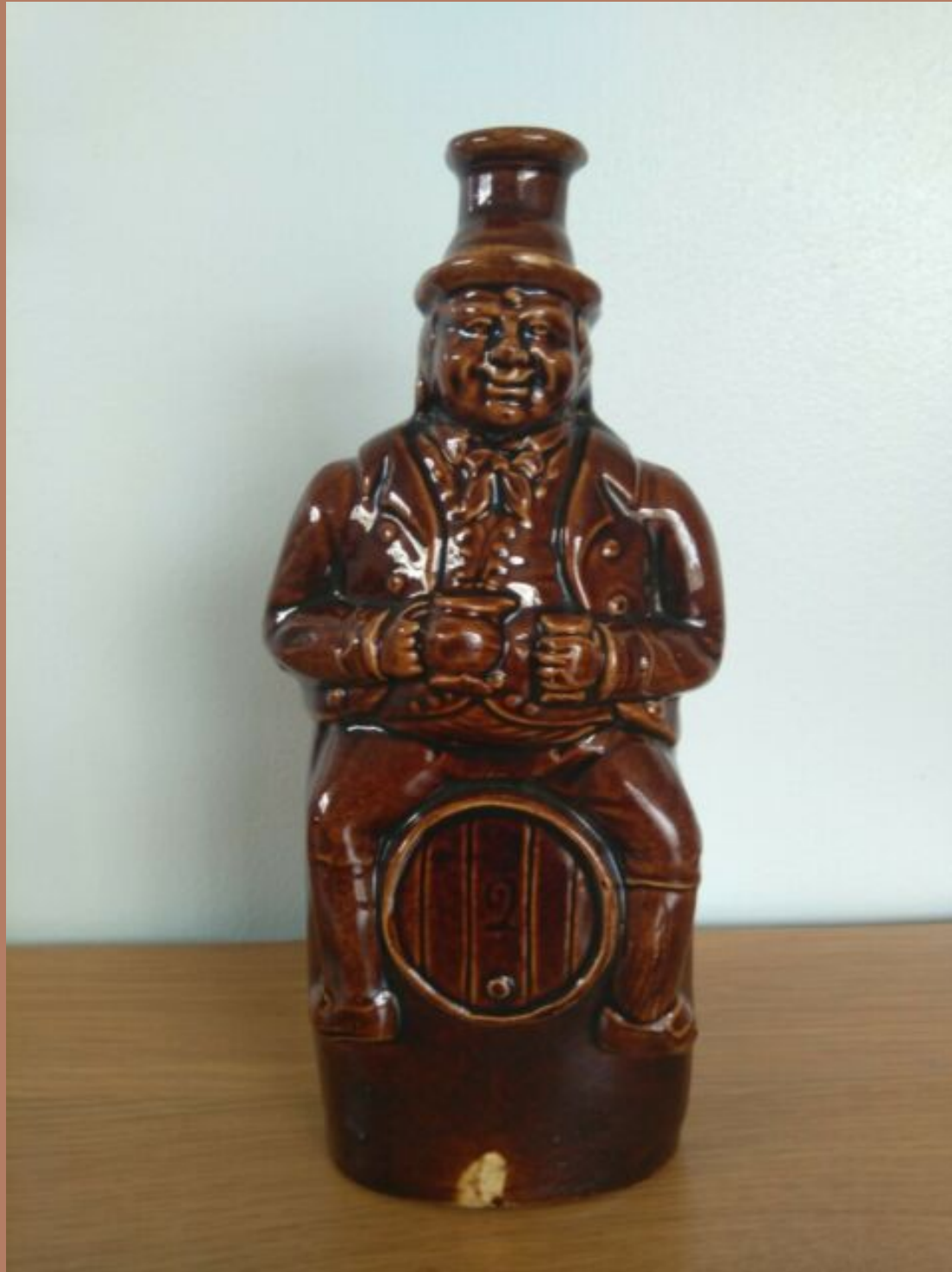
'Old Tom' (Nickname for Gin) c. 1830