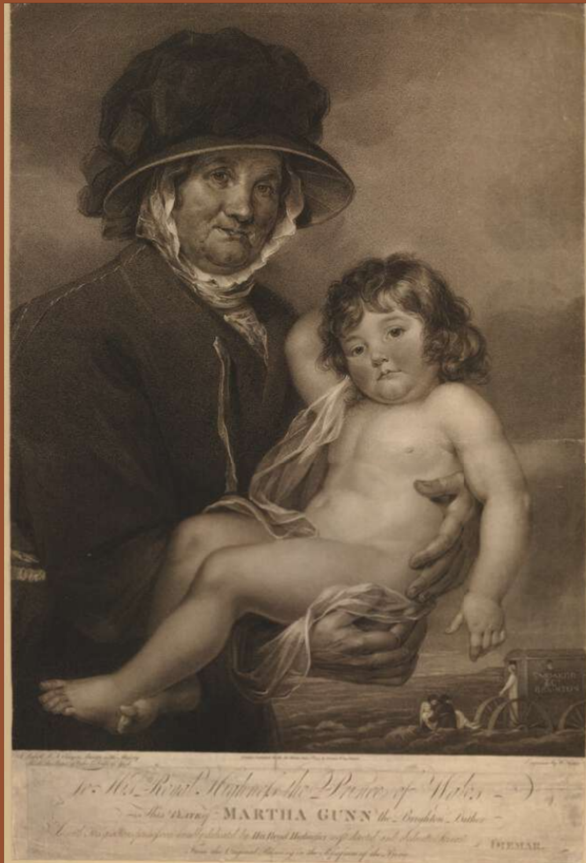
Martha Gunn portrait