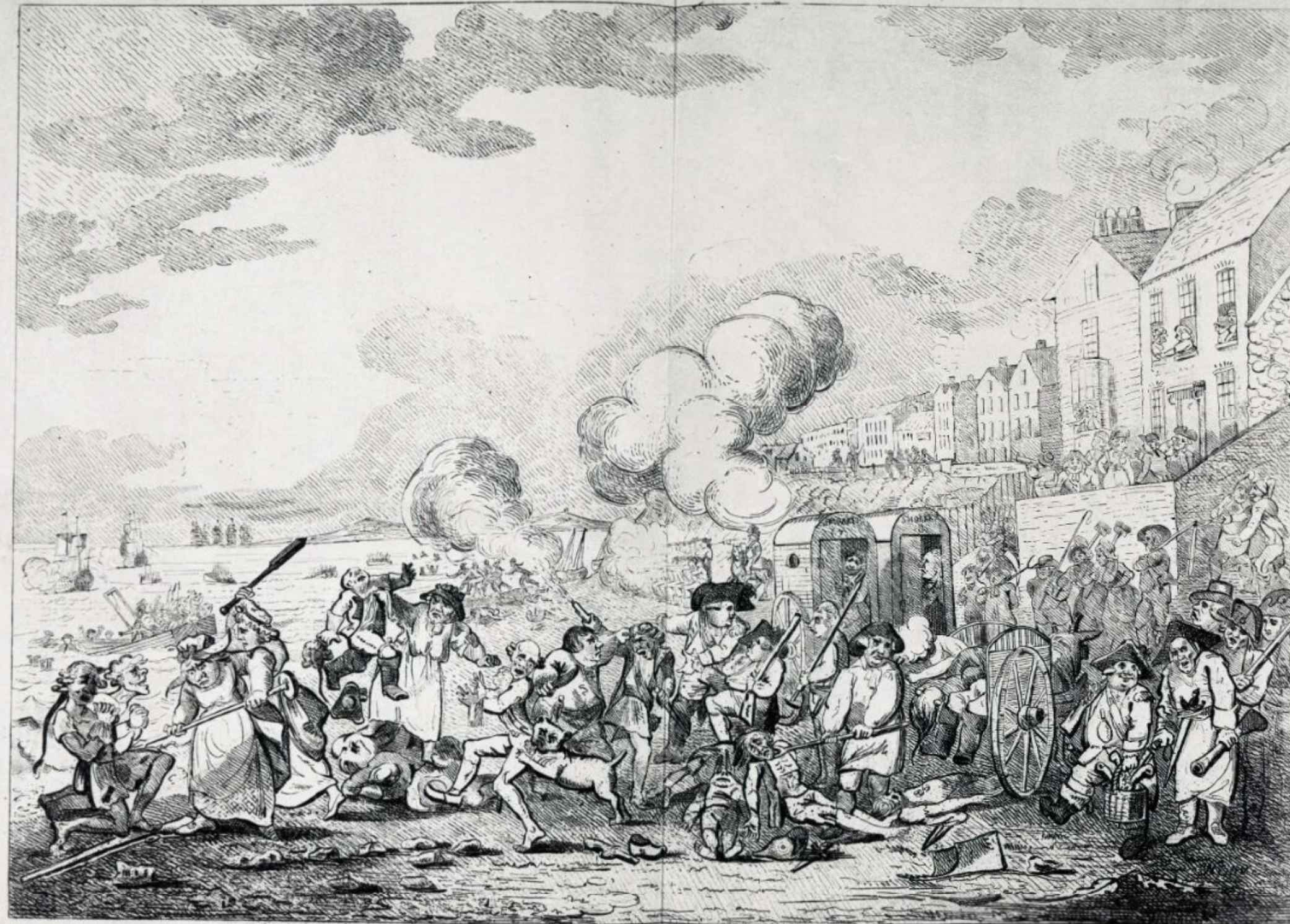
FRENCH INVASION OR BRIGHTON IN A BUSTLE.