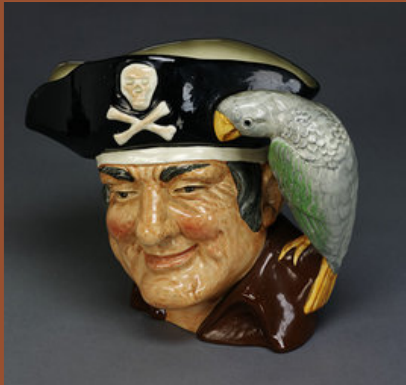
Character Jug Royal Doulton c. 1951 V&A