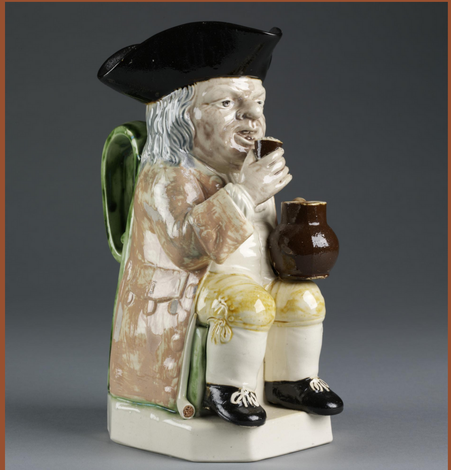
Toby Jug Ralph Wood c. 1785 V&A