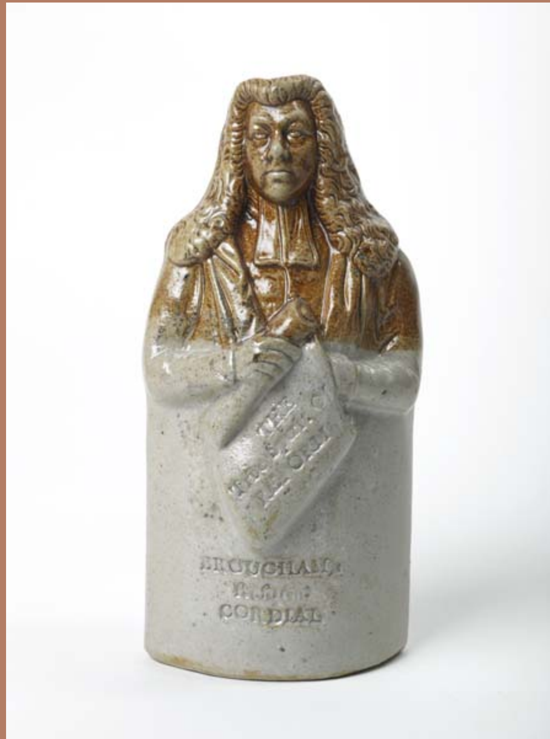
Lord Brougham Flask, Museum of London, 1832