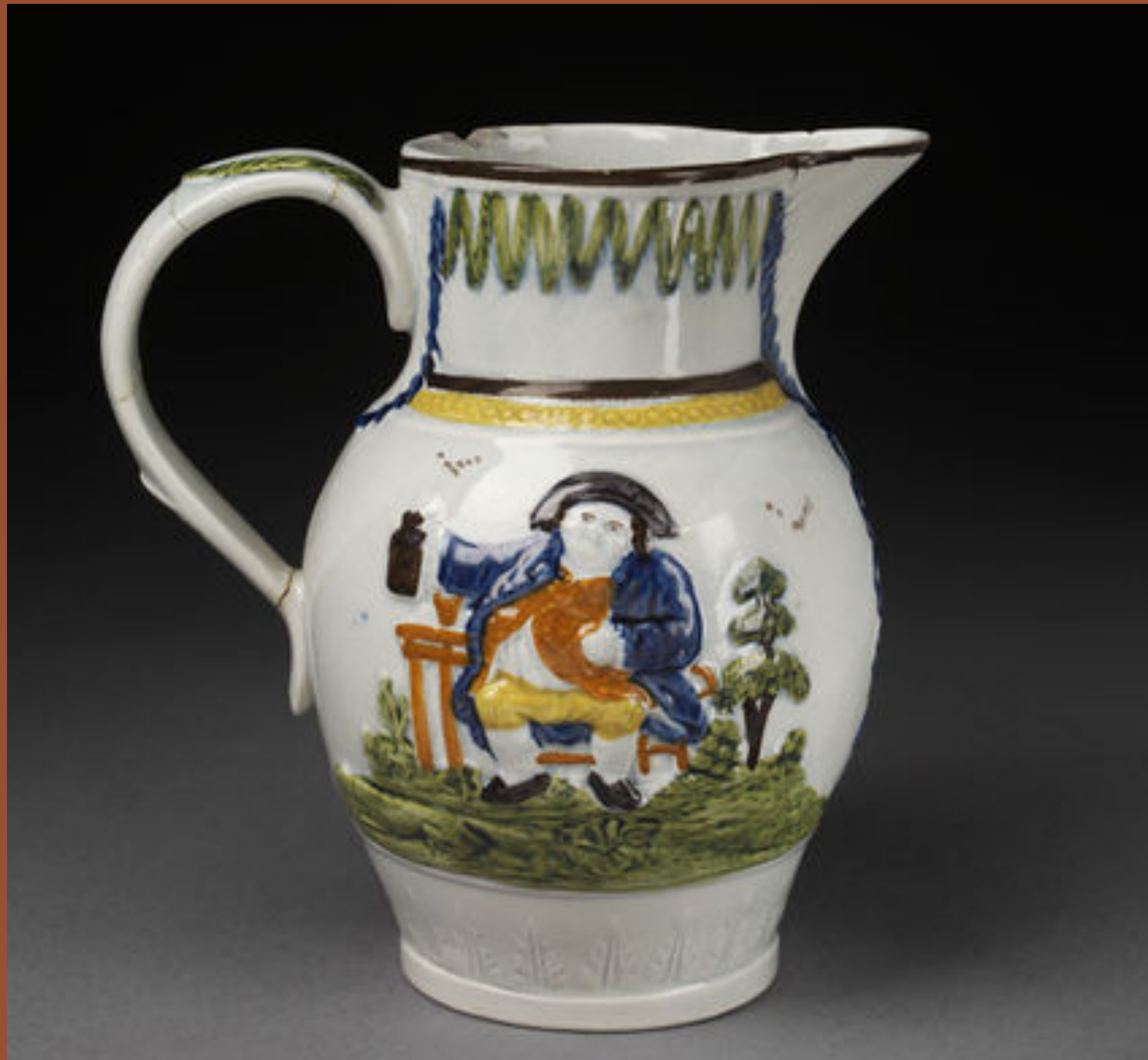
V & A