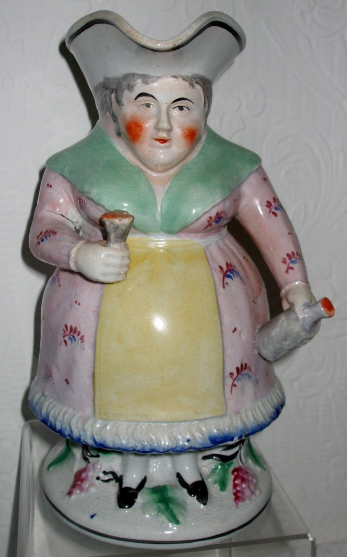
‘Gin Woman’ Toby Jugs